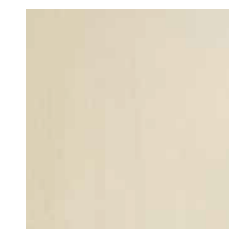
Blanc De Paris